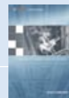
service & maintenance